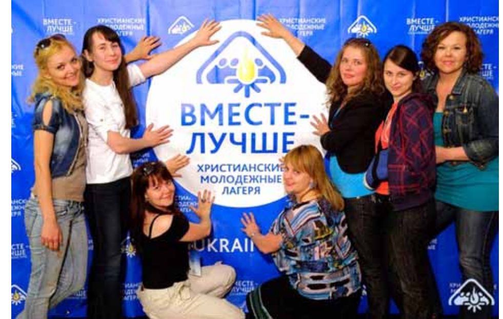
Better Together Christian Youth Camps Camp Gloria staff who attended CCI/Ukraine STW

“While I was on the train I felt confident and happy but when I arrived at the campsite I was worried. All the memories from 2003 surfaced – that was the time when I came to STW as an inexperienced 19 year-old girl. It was my very first STW with CCI and they have given me a start. I became a good facilitator. CCI had ignited a camp ministry fire that is still burning in my life. At first, our camp copied the structure proposed by CCI. Over the years, we developed our own camp, our own rules, the administrative system, and much more. But CCI gave us the start when we knew nothing about camp and how to start a camping ministry.